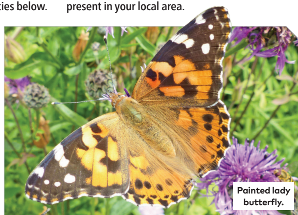
Painted lady butterfly.