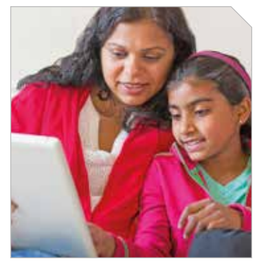
Learn about the local wildlife in your area and teach your friends and family about it.