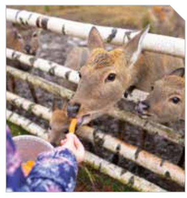
Visit a national park or wildlife refuge. These protected areas are home to all sorts of plants and wildlife.