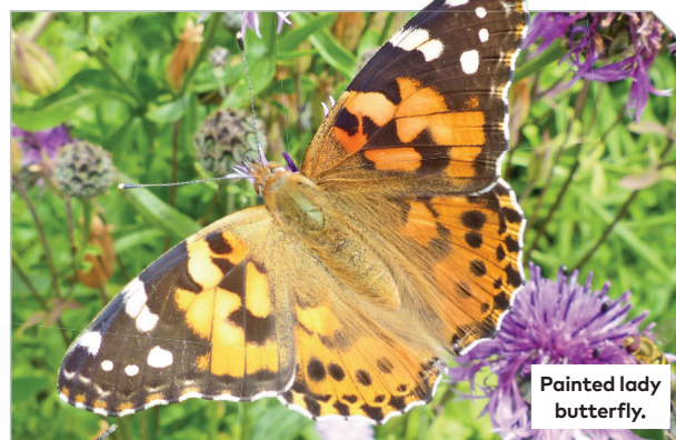
Painted lady butterfly.