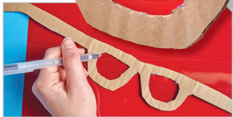
2 Now place the glasses onto the red acetate sheet. Trace out the shape of the lenses with the black pen.