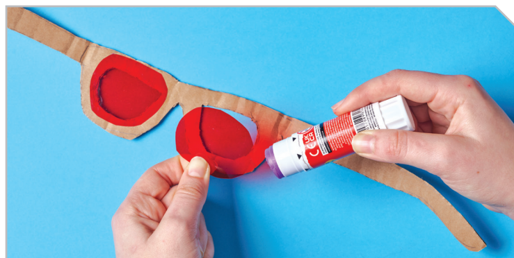
3 Cut out two lenses for your glasses – you’ll need to make them slightly larger than the shapes you traced in the last step. Glue them in place on the inside of your cardboard glasses.