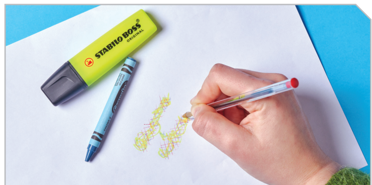
4 Write a secret message using the blue crayon. Then draw crosshatching over the top with the red pen. Then scribble over everything using the yellow highlighter. The message should be invisible until you put on the glasses.