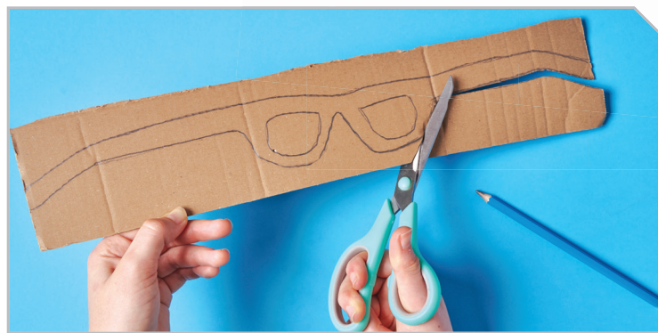
1 Draw the outline of a pair of glasses onto a long piece of cardboard and carefully cut it out. Experiment with the shape to create a funky design.