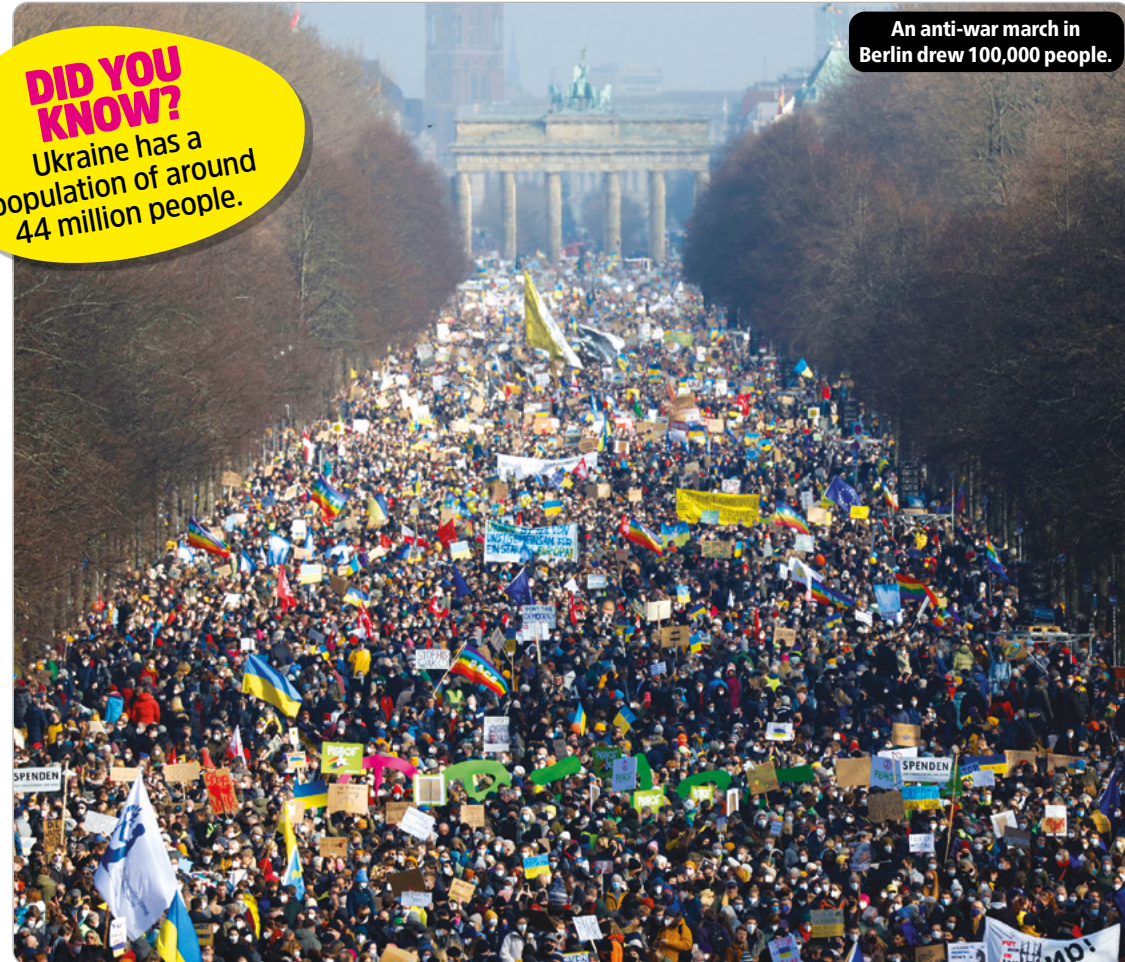
An anti-war march in Berlin drew 100,000 people.

DID YOU KNOW? Ukraine has a population of around 44 million people.