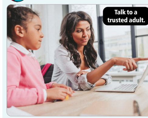
Talk to a trusted adult.

It is normal to feel worried or upset if you see news that is scary, such as the news about Ukraine. Make sure that you talk to a parent, guardian or an adult you trust about what you are hearing and seeing. Childline, a service supporting young people, says, "It can really help to share your feelings." It is also important to remember the following: