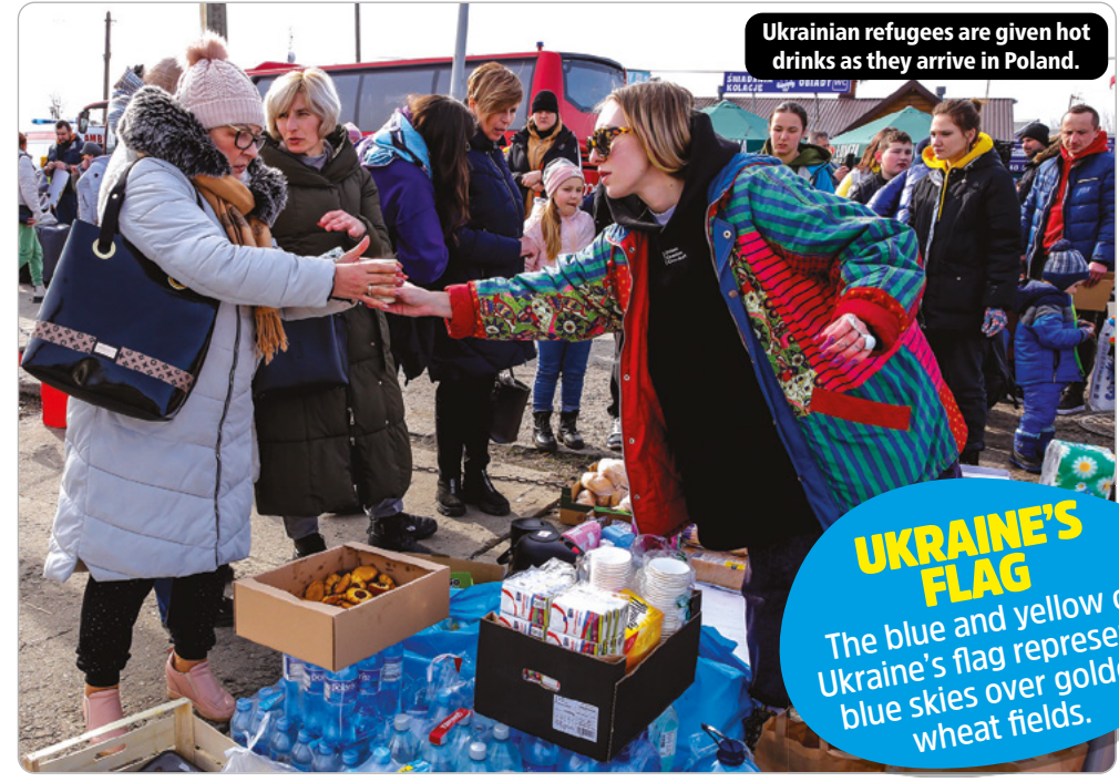
Ukrainian refugees are given hot drinks as they arrive in Poland.